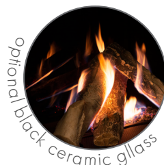
optional black ceramic glass

The vertical campfire burner introduces a classic fire design to your interior. It is decorated with ceramic logs, vermiculite, slate chips and glowing fiber. As an option you can choose an elegant high-gloss black ceramic glass for the back wall.